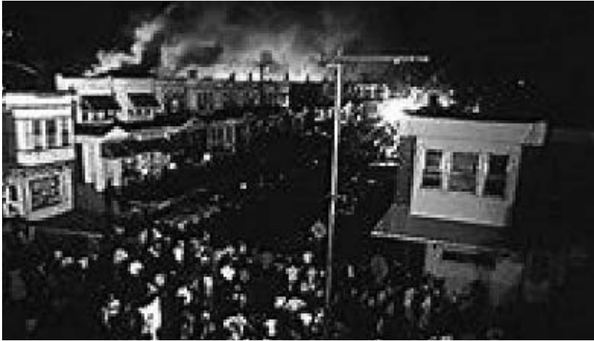
May 13, 1985, an example of brutal repression at home was the MOVE massacre. Police dropped two bombs on the MOVE house killing six adults and five children, and burning 61 homes.

This brings us to a most fundamental point that is so often ignored or glossed over in discussions and debates about democracy in countries like the U.S.: The fact is that even the extent to which rights are allowed to the nonruling classes in imperialist countries depends on a situation where, in large parts of the world under imperialist domination, the masses of people are subjected to much more open and murderous repression. In short,