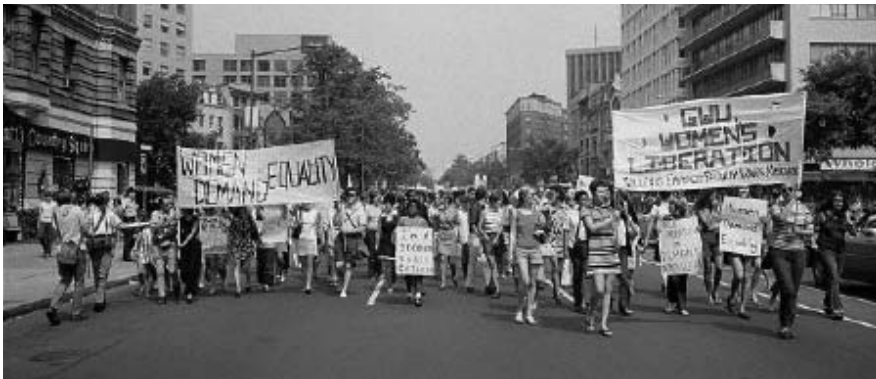
The 1960s and '70s have seen political and legal changes that have brought certain extensions of formal rights to women.