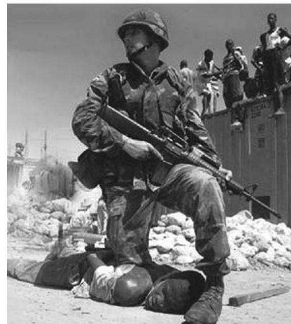
In large parts of the world under imperialist domination, the masses of people are subjected to much more open and murderous repression. Here, armed Marine kneels on back of a Haitian during 1994 U.S. occupation of Haiti.

something confined within and conforming to bourgeois domination and dictatorship.